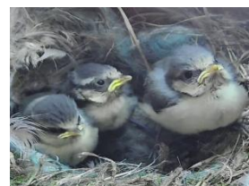
The blue tits have fledged.