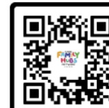
Lancaster Family hub